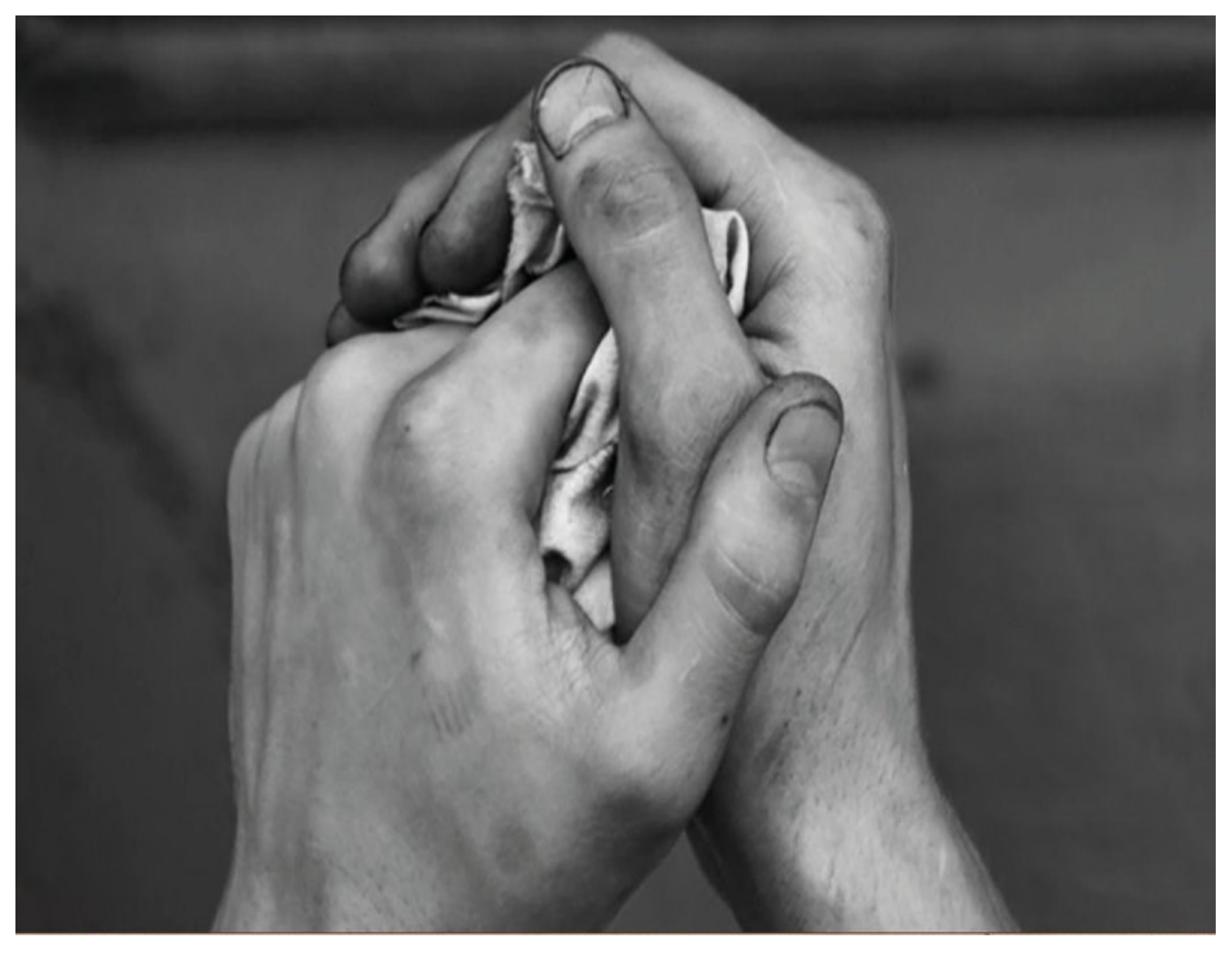
"Whoever exalts himself will be humbled; but whoever humbles himself will be exalted."