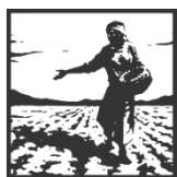
"A sower went out to sow" Matthew 13:3

May our stewardship of time, talent, and treasure show us to be among those who have heard the message of Christ and taken it in, yielding a hundred-or-sixty-or thirty-fold.